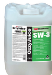
SW-3 OZZYJUICE® TRUCK GRADE DEGREASING SOLUTION