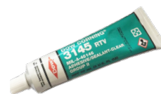
■ DOW 3145 RTV