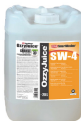
SW-4 OZZYJUICE® HEAVY DUTY DEGREASING SOLUTION