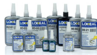
Retaining Anaerobic Adhesives