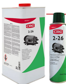
2-26 Multipurpose Lubricant