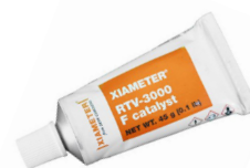
■ XIAMETER RTV 3000