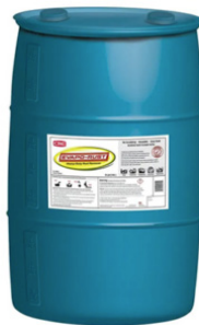
Heavy-Duty Rust Remover, 55 GAL