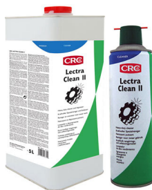
LECTRA CLEAN II Cleaners - Heavy duty