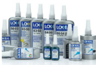
Threadsealing Anaerobic Adhesives