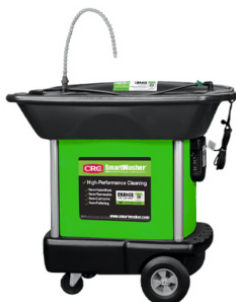
SW-37 MOBILE HEAVY-WEIGHT PARTS WASHER