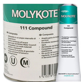
MOLYKOTE® 111 Compound