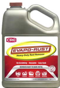
Heavy-Duty Rust Remover, 1 Gal