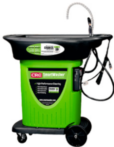
SW-23 MOBILE PARTS & BRAKE WASHER