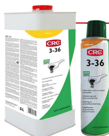
3-36 Corrosion Protection