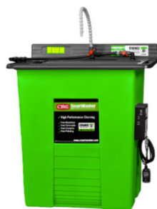
SW-25 SIGNATURE PARTS WASHER