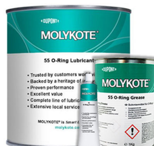
MOLYKOTE® 55 O-Ring Grease