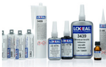
Structural Acrylic Adhesive