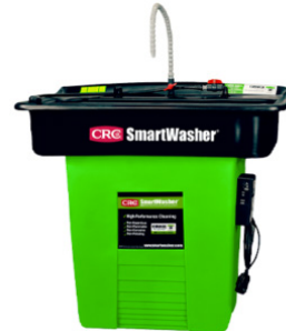
SW-28 SUPERSINK PARTS WASHER